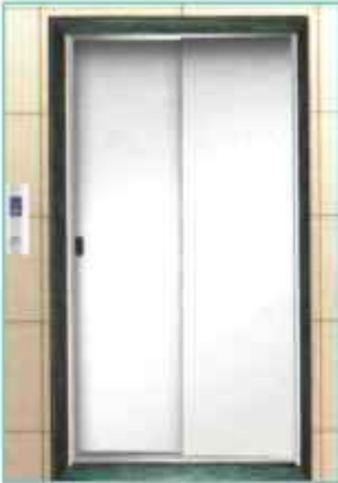
S.S. Manule Telescopic Door