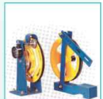
Over Speed Governor