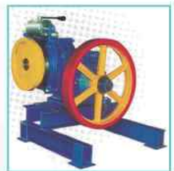
Single Shaft Traction M/C.