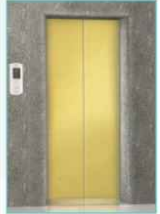
M.S. Auto Doors