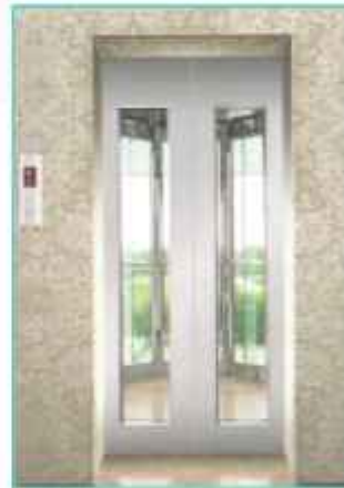
S.S. Glass Auto Doors