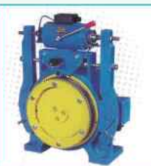
Gearless Permanent Magnet