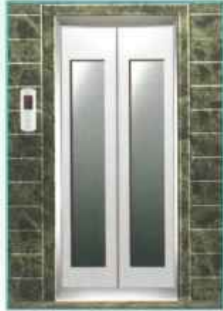
M.S. Auto Glass Door