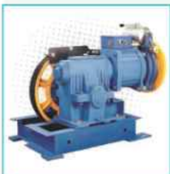
Single Shaft Traction M/C.